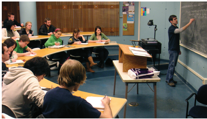
STUDENTS HARD AT WORK IN AN ECON 200 CLASS

Starting this fall, the Economics Department will adopt a new, competitive admissions process. Competitive majors require students to complete specific prerequisites and maintain a minimum GPA in order to apply. Prospective economics majors will soon be required to maintain a GPA of at least 2.5 and will need to complete 45 credits in prerequisite coursework before applying to the major. Although required courses vary slightly between the BA and BS tracks, both programs will require applicants to complete a one page personal statement describing their specific interest in the major, background, and personal/educational goals.