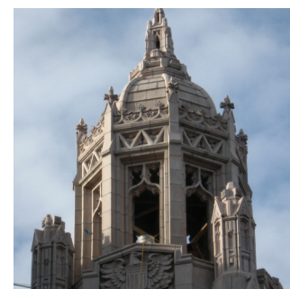
THE OUTSIDE OF SAVERY HALL HAS BEEN CAREFULLY PRESERVED

friendly windows were installed to improve insulation and help regulate temperature in the building, and the newly exposed high ceilings have been paired with innovative interior glasswork to create bright, airy spaces with lots of natural light.