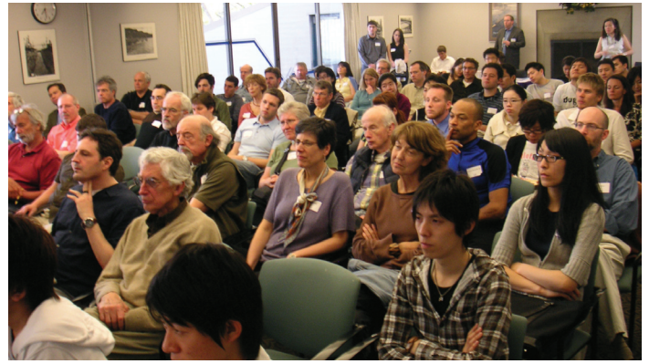
ATTENDEES AT THE 2009 NOBEL PRIZE LECTURE IN ECONOMICS.