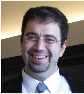
PROF. DARON ACEMOGLU