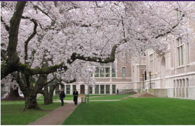
THE CHERRY TREES IN BLOOM OUTSIDE OF SAVERY HALL.