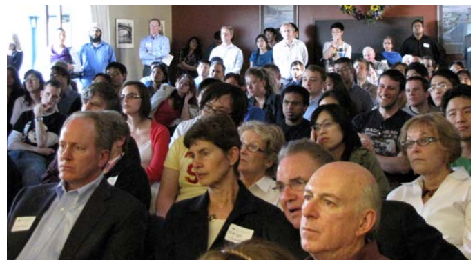
ATTENDEES AT THE 2011 MILLIMAN LECTURE.

speakers like Professors Acemoglu and Lucas, and because of the generosity of our donors, we are able to present these lectures free of charge.