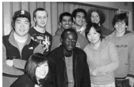
MEMBERS OF THE ECONOMICS UNDERGRADUATE BOARD

Student members of the Economics Undergraduate Board (EUB) hosted three lectures this year as part of the quarterly Heyne Seminars in Economics. Each Seminar featured a lecture by a different faculty member, high-