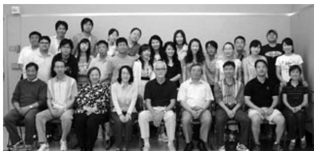
RCIE TRAINING PROGRAM CLASS OF 2007

The Center also had success with its new training program this year. The training program was created to provide instruction in writing, editing and submitting academic research papers for publication in international journals. The program was held on the University of Washington Campus in August 2007 and had participants from all over the world. Sixteen speakers gave 24 lectures to the 27 attendees who came from South Korea, Taiwan, Japan and Thailand.