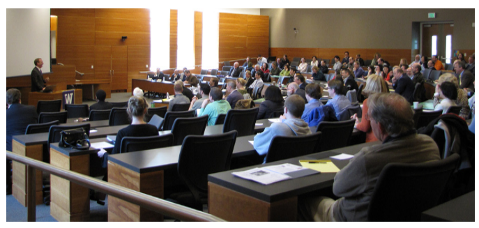
ATTENDEES AT THE EPRC CONFERENCE

The Economic Policy Research Center provides a forum for economic policy discussions vital to the Northwest, engaging public and private sector stakeholders with University of Washington faculty to clarify and improve economic content of public policy. The Center continues to serve as a resource to the region, providing access to policy design solutions for researchers and practitioners alike.