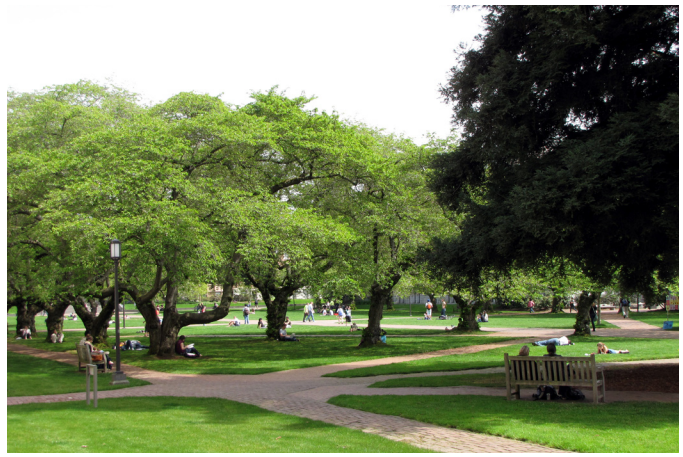
THE OUAD IN SPRINGTIME